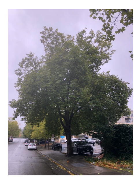
Tree 3 - Northeast View